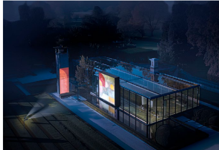
© ERCO GmbH, Visualization: Axel Gross